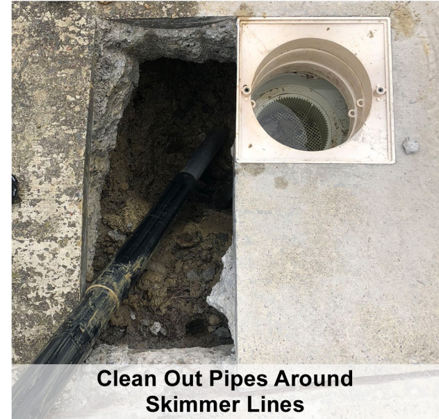
Clean Out Pipes Around Skimmer Lines