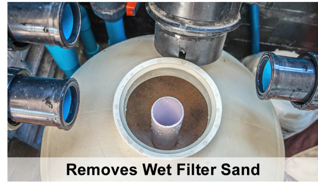
Removes Wet Filter Sand