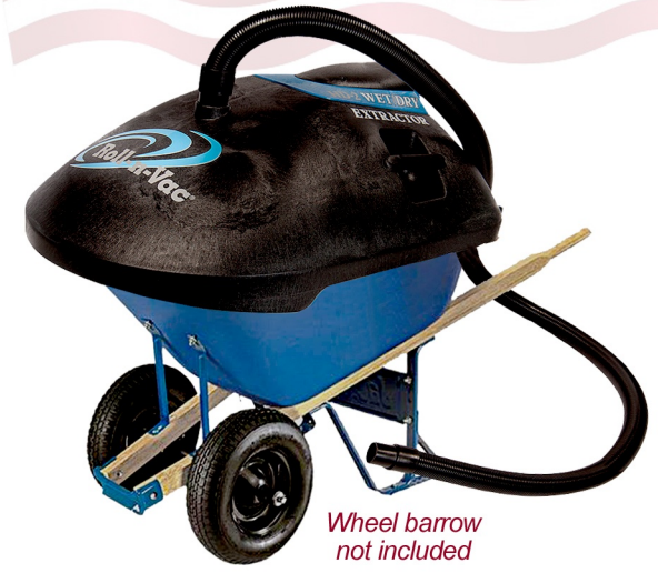
Wheel barrow not included

The Roll-n-Vac® is designed for heavy duty performance. It saves time which saves money .